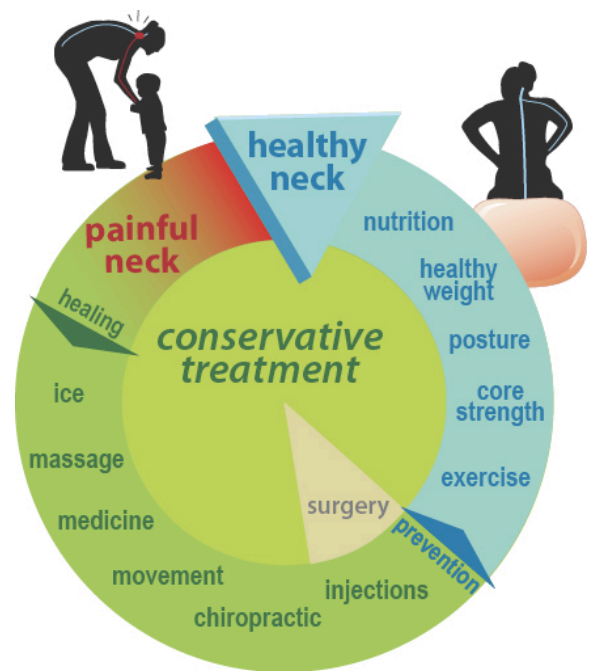
Figure 2. Exercise, strengthening, stretching and ideal weight loss are key elements to your treatment.

Physical therapy / exercise: For most neck pain, we recommend a nearly normal schedule from the onset. Physical therapy can help you return to full activity as soon as possible and prevent re-injury. Physical therapists will show proper lifting and walking techniques, and exercises to strengthen and stretch your neck, arms, and abdominal muscles. Massage, ultrasound, diathermy, heat, and traction may also be recommended for short periods. People may also benefit from yoga, chiropractic manipulation, and acupuncture.